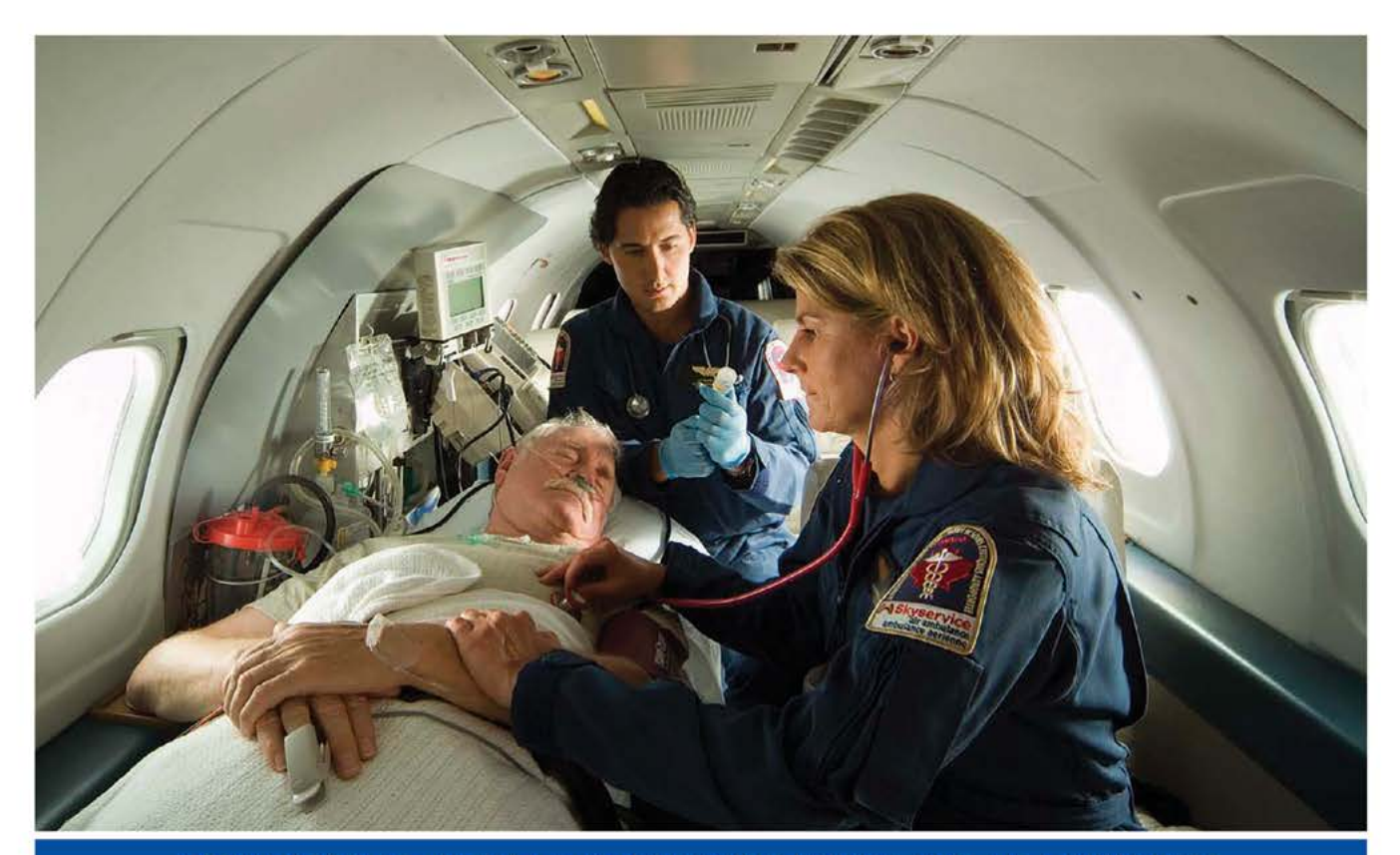
NOW ARRIVING: NORTH AMERICA'S THIRD LEARJET 45XR AIR AMBULANCE