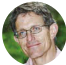
Simon Calder Travel Writer, The Independent